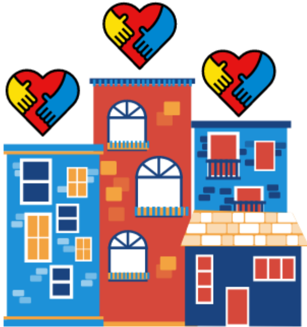
Community And Resilient Environments (CARE) Project

A community-driven project of how neighborhood environments shape teen and family health and wellbeing