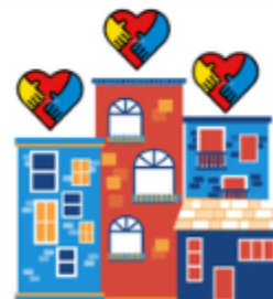
Community And Resilient Environments (CARE) Study